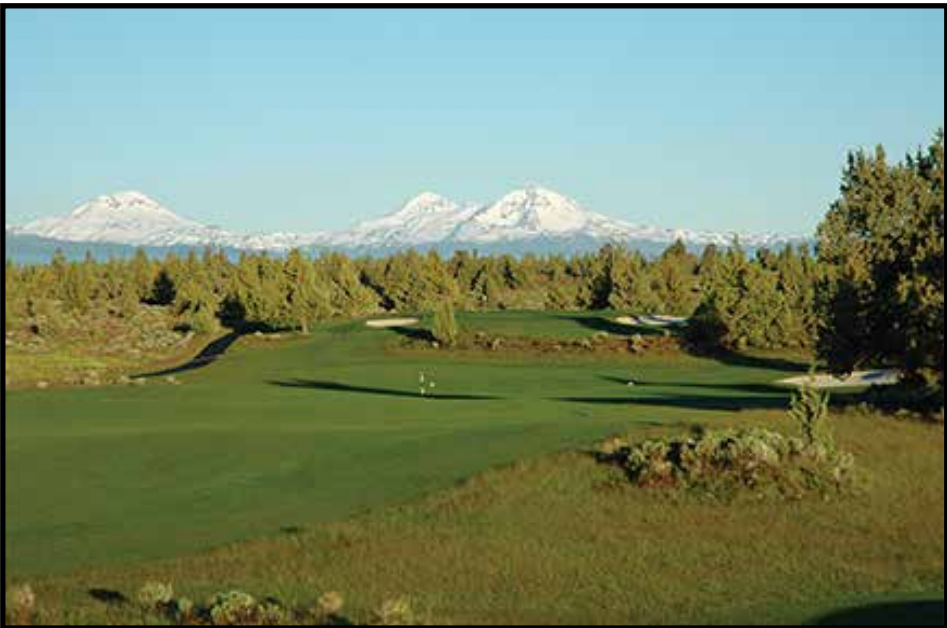
Juniper Golf Course in Redmond, Ore. is a terrific fall option for golfers in the Central Oregon area.

There's no doubt that Central Oregon continues to be a fantastic option for golfers in the region looking for a fast golf getaway. When you hear golfers talk about their plans for golf in Central Oregon, the resorts in the area are typically front of mind. But with so many golf courses to choose from during your golf getaway, those who really know golf in Central Oregon often talk about the only resort quality golf course that is municipally owned, seconds from the airport in Redmond, Ore. If your knowledge of the Central Oregon golf market runs deep, there's a good chance you've never heard of Juniper Golf Course. In fact, the history of this golf course is extremely unusual. It's rare that a golf course completely moves from one location to another, but that's exactly what Juniper Golf Course did, relocating on a new piece of property a short drive away from its original location. Once a private 9-hole golf club, the City of Redmond acquired a larger property and then enlisted the design services of John Harbottle, and reopened in 2005 with 18 championship holes carved through the beautiful high desert landscape. The end result is a very popular and challenging layout with consistently superior course conditions and an experience that is unusually nice for