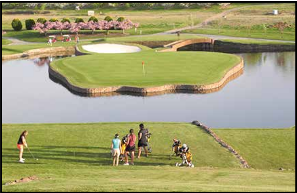
Lake Chelan Golf Course (top) and Apple Tree in Yakima are two terrific fall golf options.