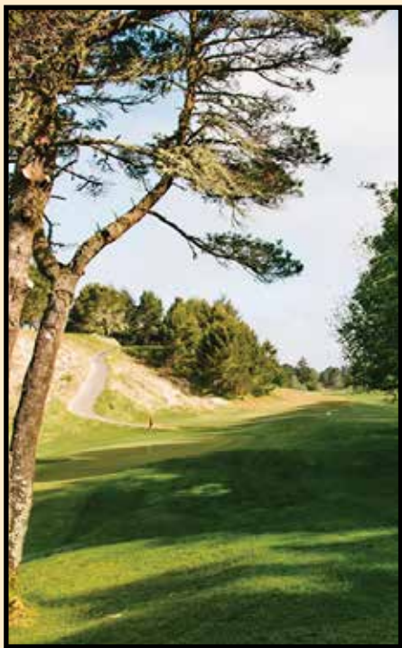
Ocean Dunes Golf Course in Florence.

Nestled near the site of a historic encampment of the Cayuse Indians lies a 248-