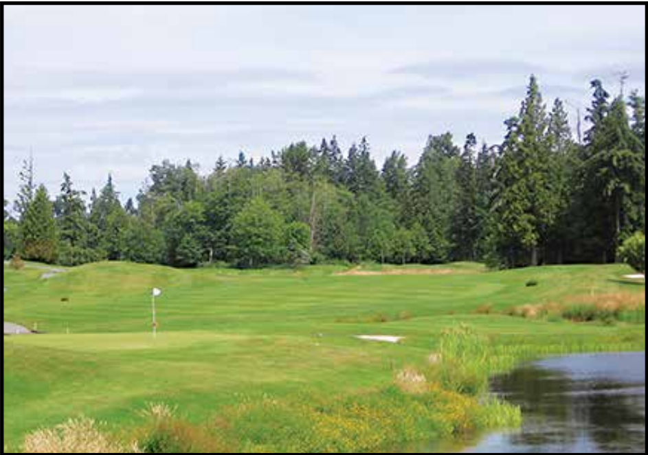
Fall golf at places like Loomis Trails in Blaine, Wash. (top) and Port Ludlow (bottom) are great choices.

Chances are, you can find a lot of deals on clubs as the season winds down. Rather than wait until the spring when the prices go up, why not get a set now and get break it in this fall?